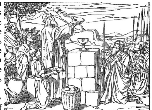
MELCHISEDECH BROUGHT FORTH BREAD AND WINE For he was the priest of the most high God (Genesis 14:18)

• less obvious is changing Water into Wine at the