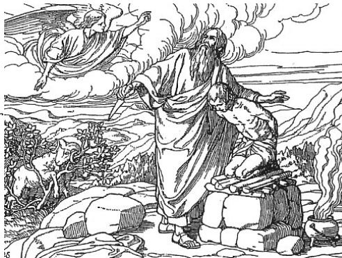
ABRAHAM'S SACRIFICE OF ISAAC The Obedience Test (Genesis 22)

sacraments get only one each. The strictures of ruthless brevity come from working with only 50 Q&As altogether — just 50, as in the Australian Bush Catechism of Camping , from which came the idea of this shorter religious catechism. The allocation of these 50 Q&As is 38% for the Creed, 24% for the Sacraments, 30% for Christian Living, and 8% for Prayer, which are roughly the proportions for the four parts of the Catechism of the Catholic Church.