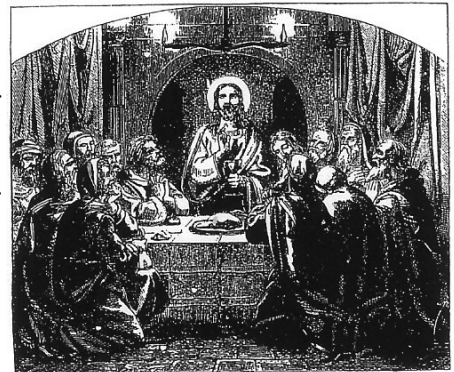
LAST SUPPER SACRIFICE OF THE NEW COVENANT in the Body and Blood of Christ, (Mark 14:24)

• as a plea for a restoration of these prayers and this psalm, at least for Masses without singing. In the latter case it could well be said in the Sacristy.