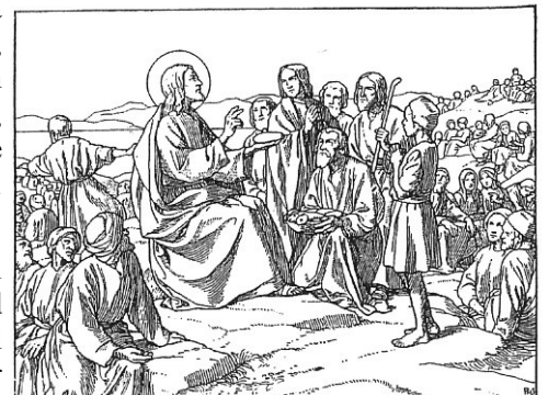
MIRACLE OF THE LOAVES AND FISHES (Mark 6:38-44) prefigured in the manna, Deuteronomy 8:3; Psalm 78[77]:25

Finally, lessons should be planned, at least in note form, with a motivation, presentation & conclusion, in an exercise book. See pp. 128-129.