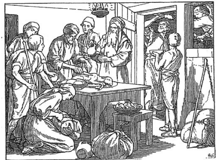
PASCHAL SACRIFICE OF THE LAMB (Mark 14:12; Luke 22:7) The Old Testament prefigures the New Testament

"To be ignorant of the Scriptures is to be ignorant of Christ," said St Jerome. See the copious lists of Bible texts, O.T. on pp. 28-30, and N.T. on pp. 34-35, 38-39. Note the cross-references to the pictures.